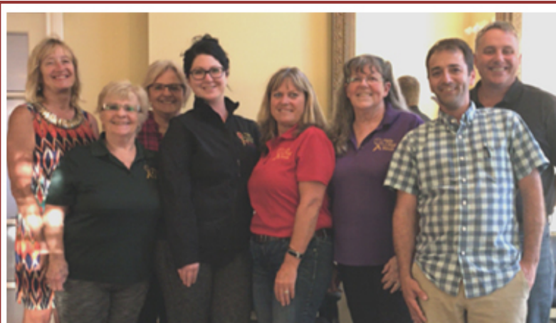
2018 - 2021 Board of Directors