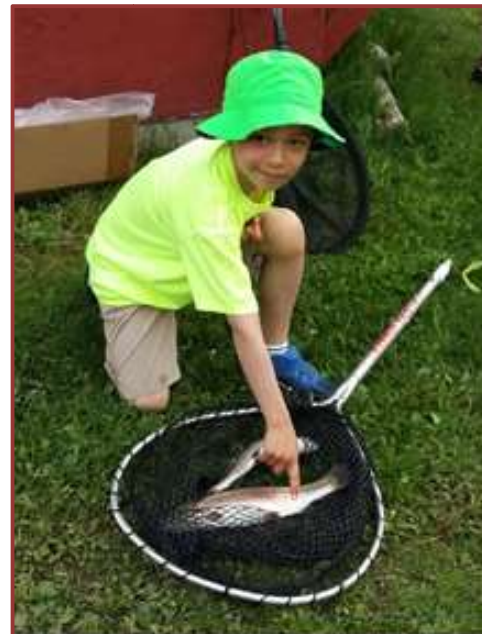
He caught the big one!