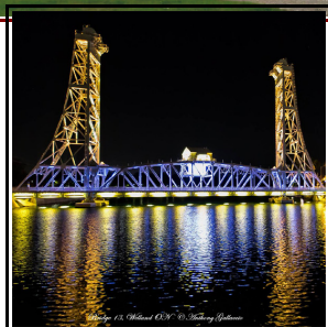
Welland Goes Gold