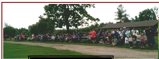
2015 African Lion Safari

The organizers of this event request that guests PLEASE do not bring outside food or drink into the building (ie Timmy's)